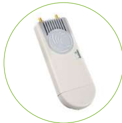
ePMP 1000 GPS Sync Radio