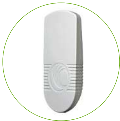
ePMP 1000 Integrated Radio