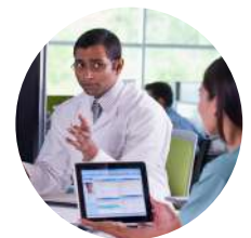
Primary or Redundant Connectivity