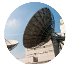
Leased Line Replacement