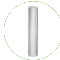
Sector antennas: 90 and 120 degrees